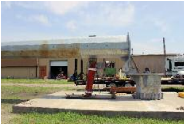
Concrete footing supports tower base and hydraulic cylinder for tipping the tower up and down.

Dakota Turbines handles the entire installation process from permitting to final inspections and commissioning. And our commitment doesn't stop there... our machine is ready for decades of service, and so are we.