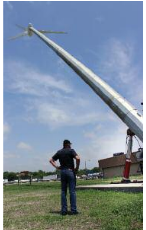
Multiple tower options are available including a 100 ft tubular tilt-up that can be raised and lowered hydraulically so that all inspections may be performed on the ground without ever requiring the use of an expensive crane.