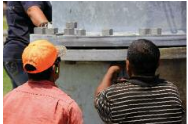
Large bolts safely secure the tower upright.

With its innovative water-cooled design, our grid-interactive inverter converts the raw turbine power to grid-quality, and safely exports clean, renewable electricity.