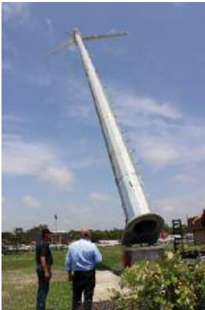
Hydraulic system safely raises and lowers the tower system providing easy installation and inspections.