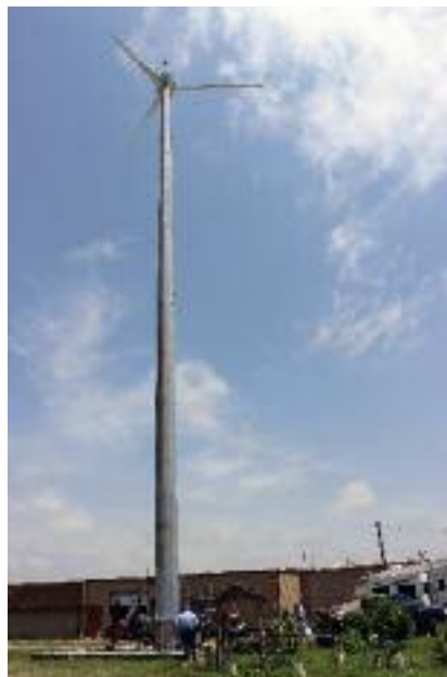
Let it fly!